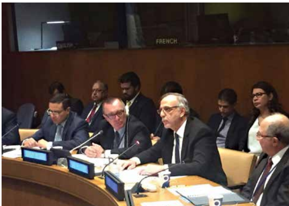
LEFT: Under-Secretary-General Jeffrey Feltman (second from left) and Iván Velásquez Gómez, Commissioner of the International Commission Against Impunity in Guatemala (CICIG) (second from right).

“CICIG is seen by many in the international community, and civil society within and outside Guatemala, as a successful model in the fight against impunity, corruption and organized crime.”