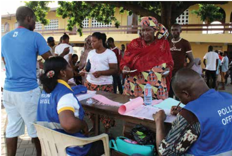
LEFT: Presidential and Parliamentary elections in Ghana.

improving efficiency or lowering costs. In other cases, automatization is prompted by a sense of urgency to overcome a specific obstacle.