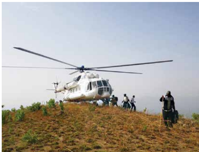
LEFT: UN Helicopter Support to the Cameroon-Nigeria Mixed Commission lands on Gotel Mountain (Cameroon/ Nigeria), to reach border areas of difficult access.