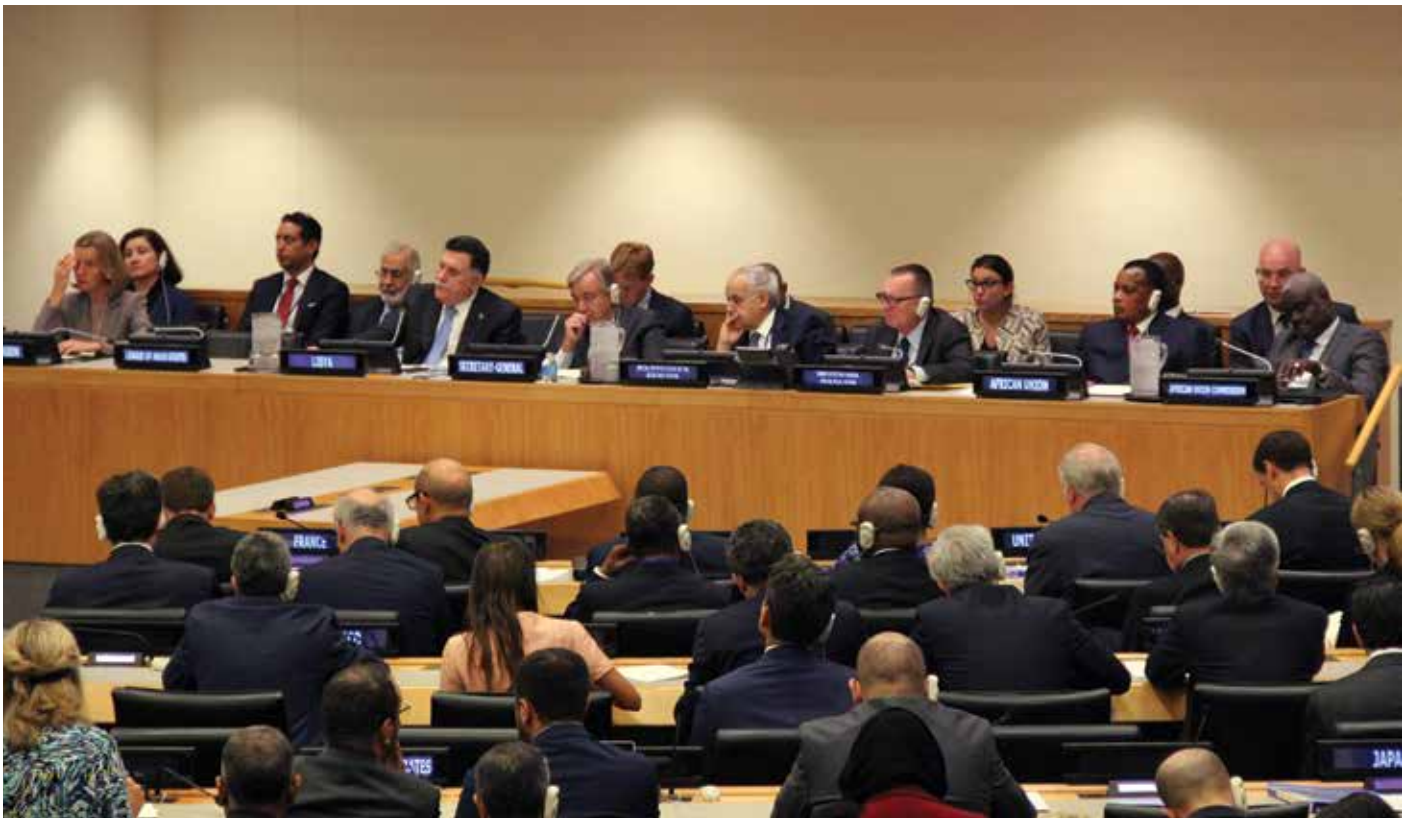
Meeting with UN Protocol and Liaison Service and Department for General Assembly and Conference Management (DGACM).