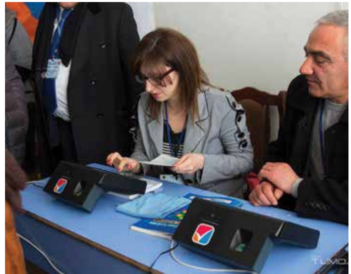
RIGHT: New Voter Authentication Devices (VADs) tested in Armenia.